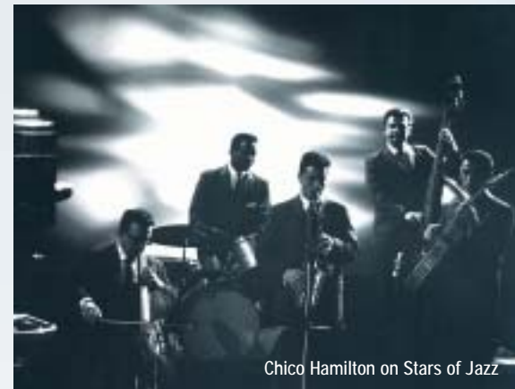
Chico Hamilton on Stars of Jazz